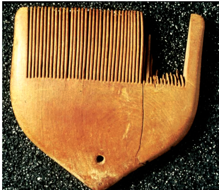
Fig. 13.4 Single-sided wooden comb from the Jordan Valley in Israel (eighth century A.D.)