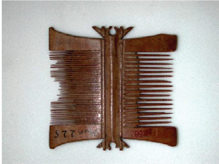
Fig. 13.3 Two-sided wooden comb from the Judean desert, Israel (135 A.D.)